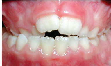
Crossbite of Back Teeth

Top teeth are to the inside of bottom teeth