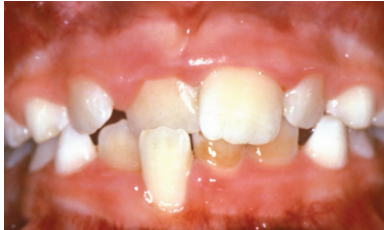
Crossbite of Front Teeth

Malocclusions (“bad bites”) like those illustrated below, may benefit from early diagnosis and referral to an orthodontic specialist for a full evaluation.